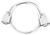
RS-232 communication cable (standard) For RS-232 communication