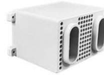
Input protective cover (standard) Standard for 6U models