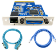
GPIB & LAN card & communication cable (optional) for communication between GPIB and LAN