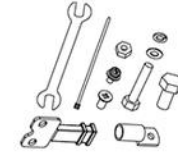
Setup package (standard)