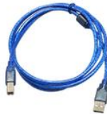
USB communication cable (standard) For USB communication