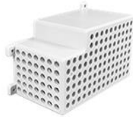
Input protective cover (standard) Standard for 3U models