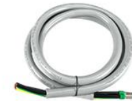
Power cable (optional) 4M or 10M