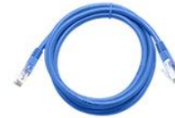
Parallel cable (standard) Connect for master-slave communication